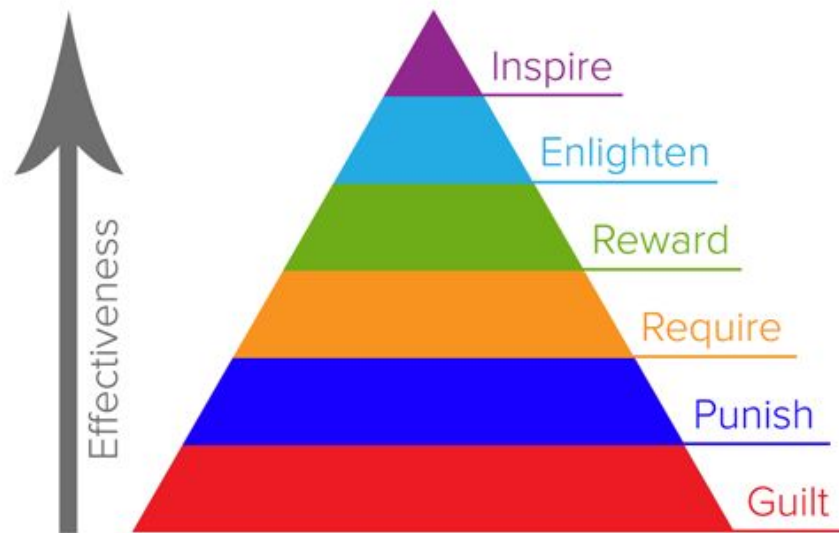
WebAIM's Hierarchy for Motivating Accessibility Change